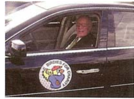
2006 Grand prize winner

Deadline for the "Guess the Birdies" contest is 5 pm on Tuesday, October 2, 2007.